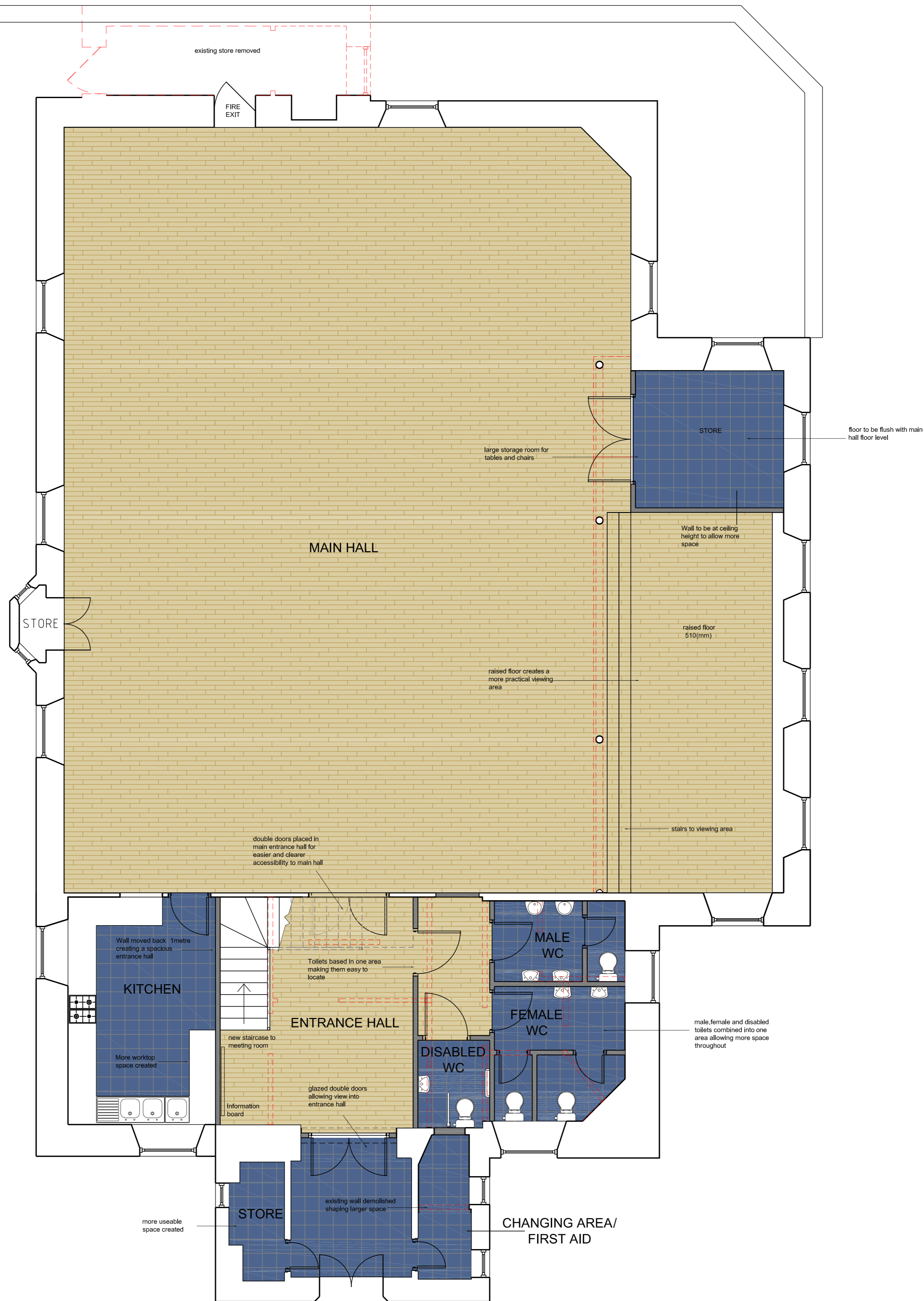
1 Ground Floor Plan 1:50